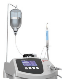
Piezo Surgery motors