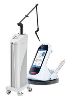
Co2 / Diode lasers